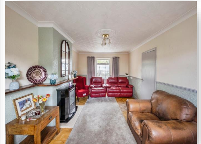
Norman Street, Thurnscoe Rotherham S63 0DR