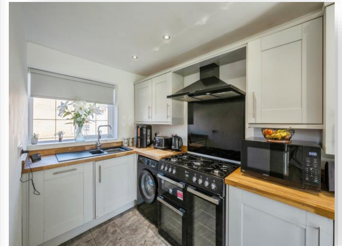
Pastures Mews, MEXBOROUGH S64 0HQ