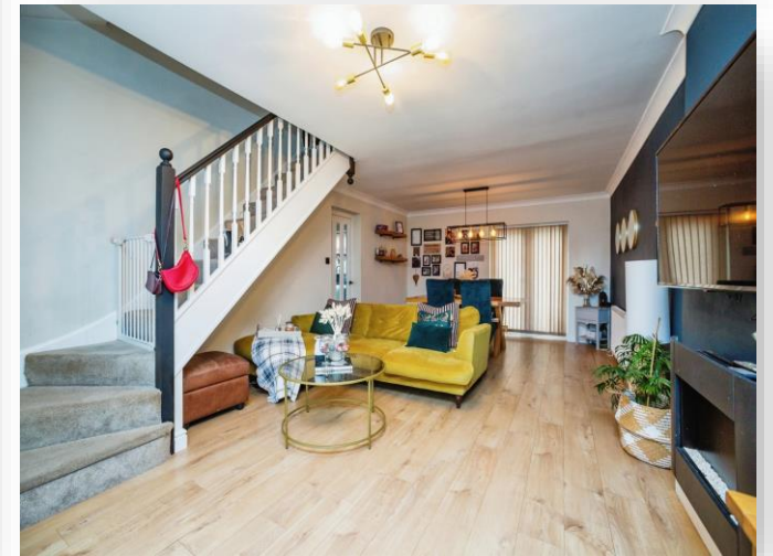
Packman Way, Wath-Upon-Dearne Rotherham S63 6BR