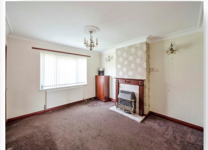
St. Peters Gate, Thurnscoe Rotherham S63 0PB