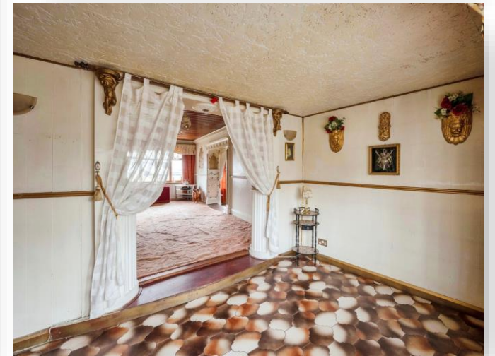
Lansdowne Crescent, Swinton Mexborough S64 8TW