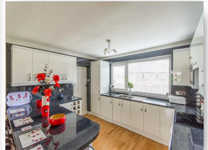
Highfield Avenue, Goldthorpe Rotherham S63 9DS