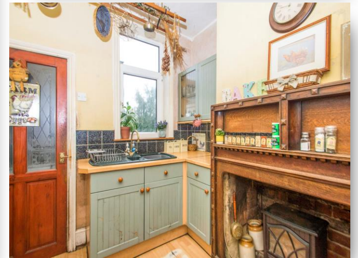
Chapel Street, Wath-upon-Deane ROTHERHAM S63 7RL