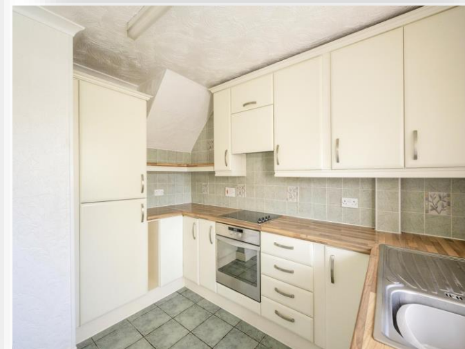
Clayfield View, Mexborough S64 0HR