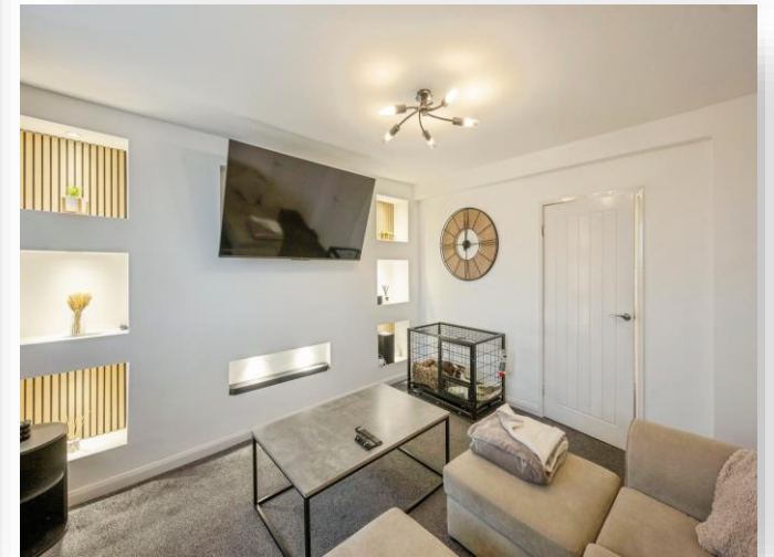
Derwent Gardens, Goldthorpe Rotherham S63 9PA