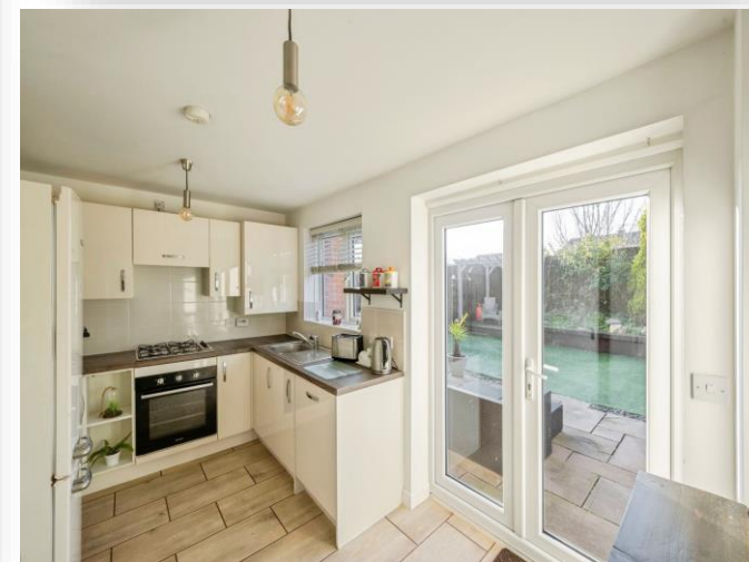
Prior Way, Bolton-Upon-Dearne Rotherham S63 8FA