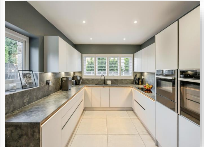
Creighton House Piccadilly Road, Swinton Mexborough S64 8JY