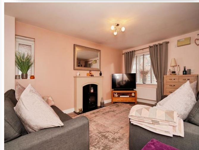
Lawnwood Drive, Goldthorpe Rotherham S63 9GD