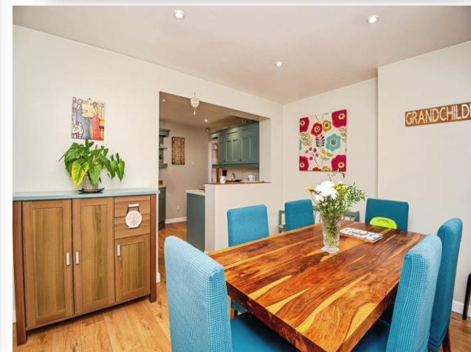
Wood Walk, Mexborough S64 9SG