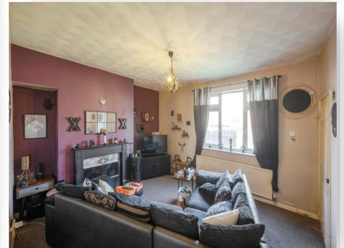
Addison Road, Mexborough S64 0DH