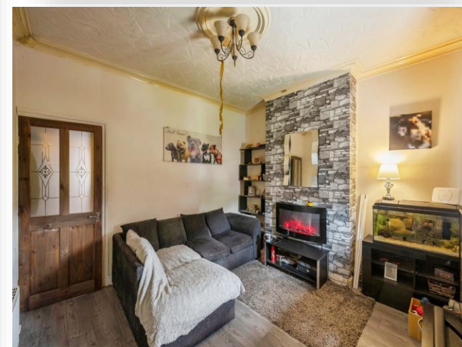
South View Main Street, Mexborough S64 9NE