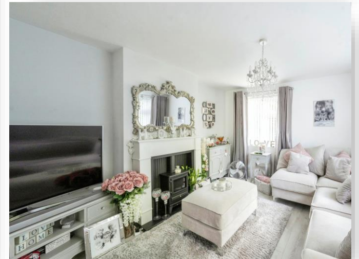
Hawthorn Grove, Conisbrough Doncaster DN12 2JU