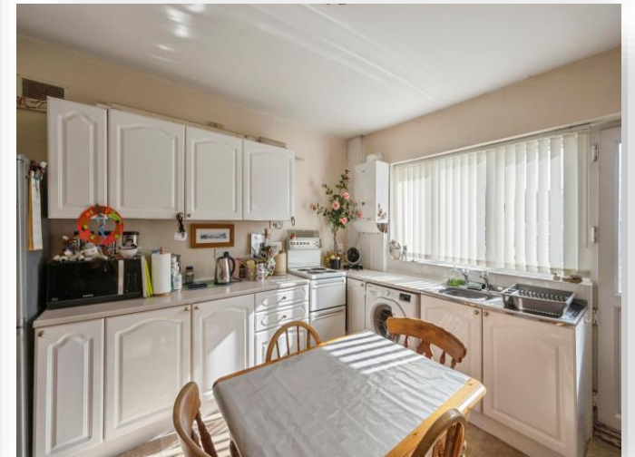
The Avenue, Harlington DONCASTER DN5 7HX