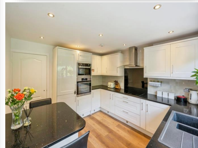
Moorland View, Wath-Upon-Dearne Rotherham S63 6DH