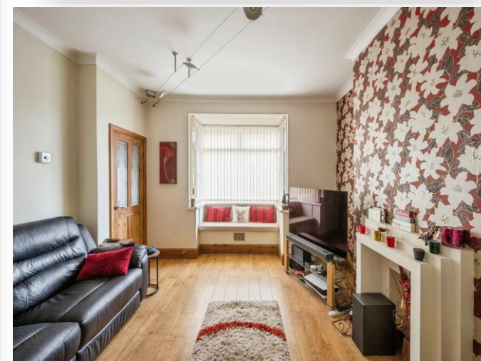
Frederick Street, Goldthorpe Rotherham S63 9NR