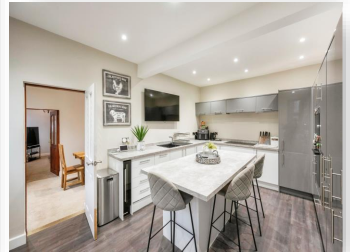
The Old Coach House Doncaster Road, Conisbrough Doncaster DN12 3AJ