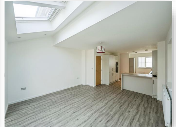
Woodlark Walk, Goldthorpe Rotherham S63 9FW