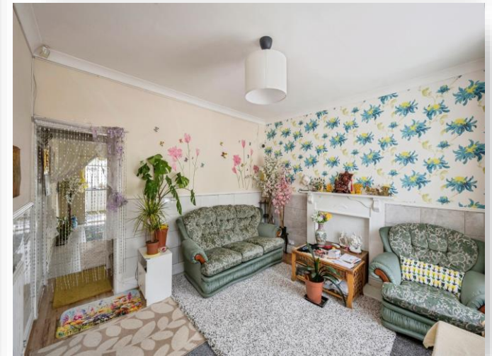
Sandymount Road, Wath-upon-Deane Rotherham S63 7AD