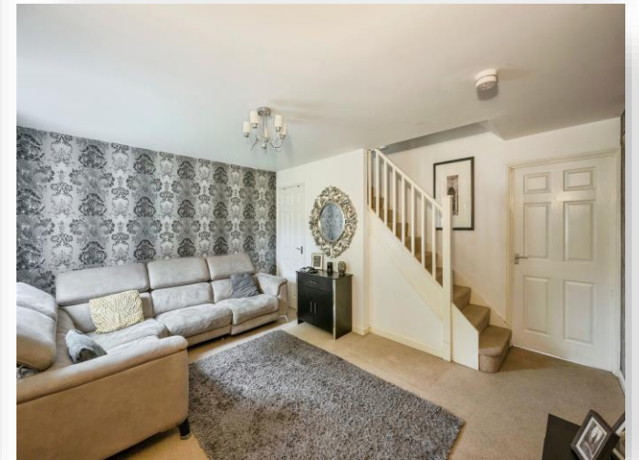
Stump Cross Court Stump Cross Road, Wath-Upon-Dearne Rotherham S63 7TB