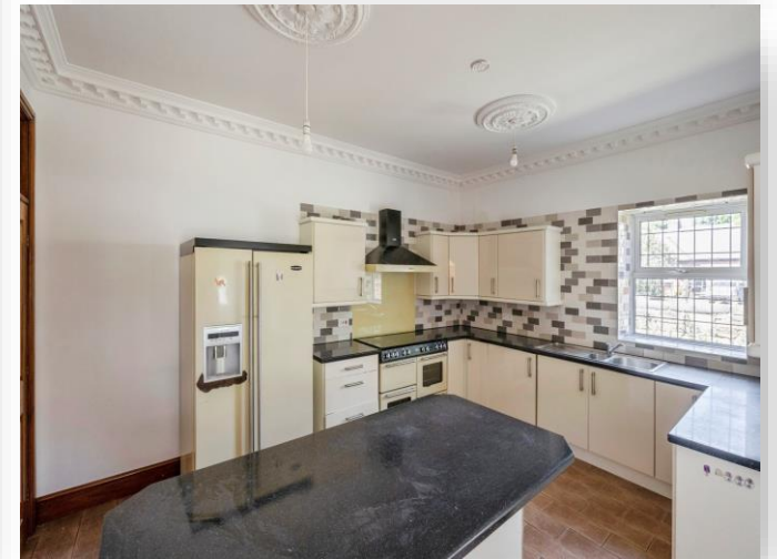
High Street, Thurnscoe Rotherham S63 0ST