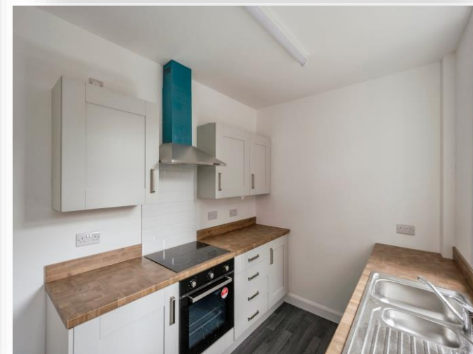
Victoria Road, Mexborough S64 9BY