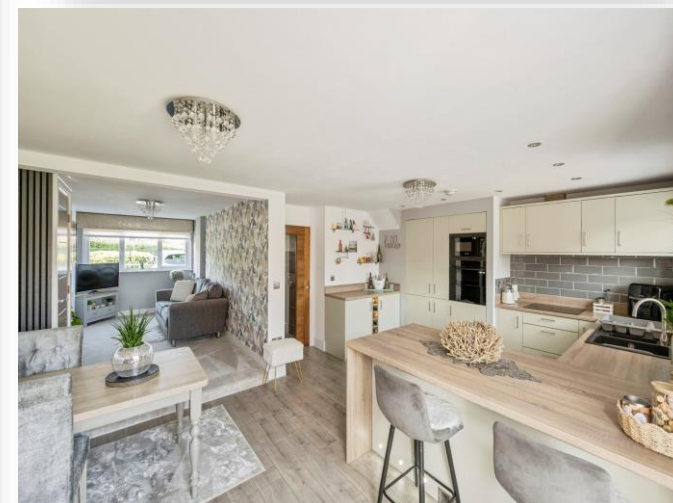
Thornham Meadows, Goldthorpe Rotherham S63 9GL