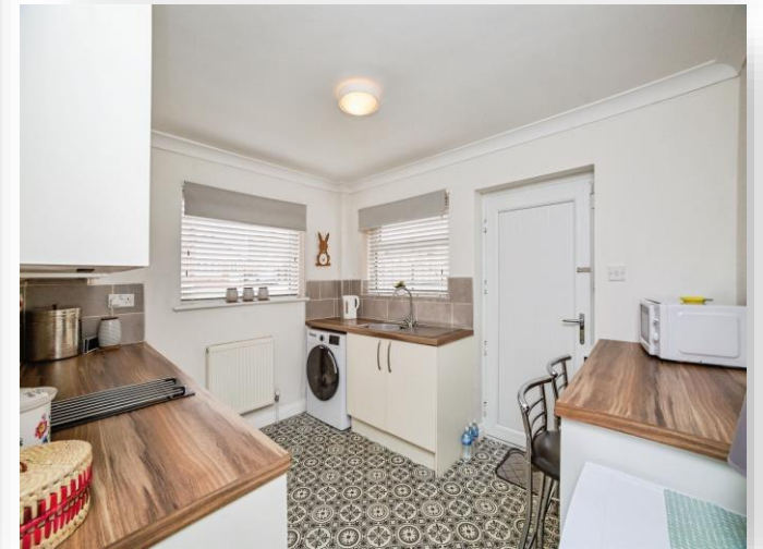
Lime Grove, Swinton Mexborough S64 8TU