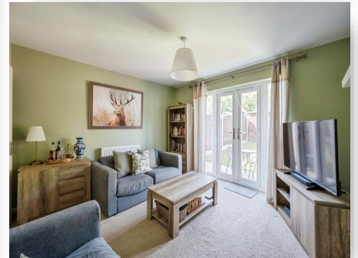
Kents Grove, Goldthorpe Rotherham S63 9GX