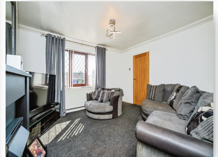
Clayfield View, Mexborough S64 0HR