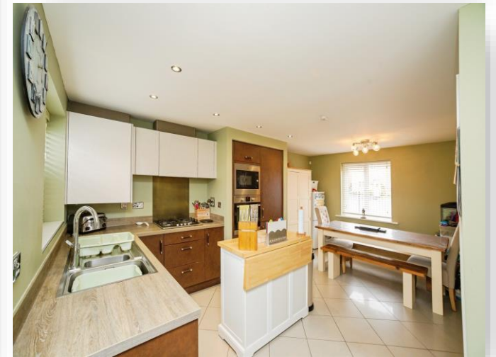
Thornham Meadows, Goldthorpe Rotherham S63 9GL