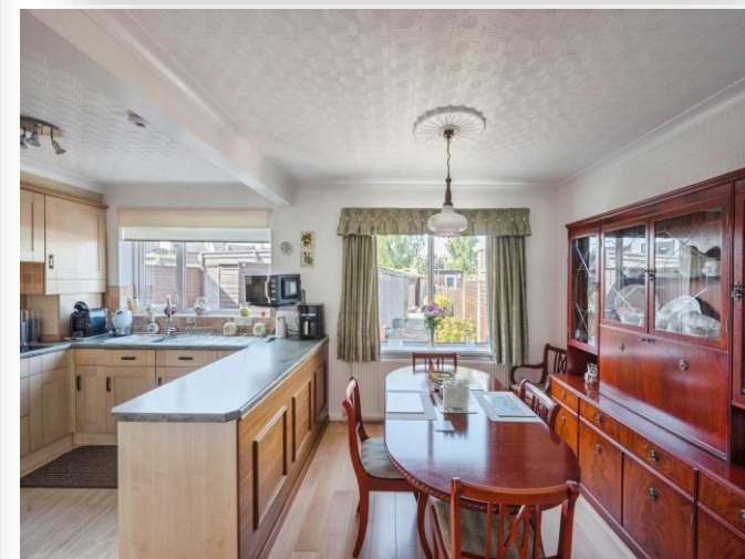
March Vale Rise, Conisbrough Doncaster DN12 2EW