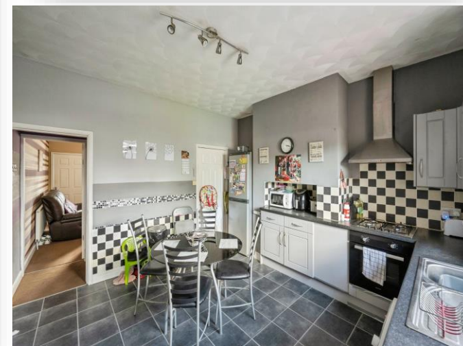
Carnley Street, Wath-upon-Deane Rotherham S63 6AZ