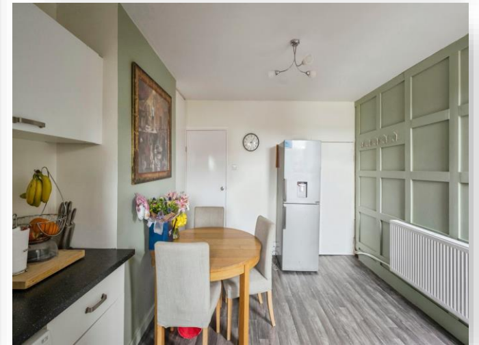
Kelvin Street, Mexborough S64 9BH