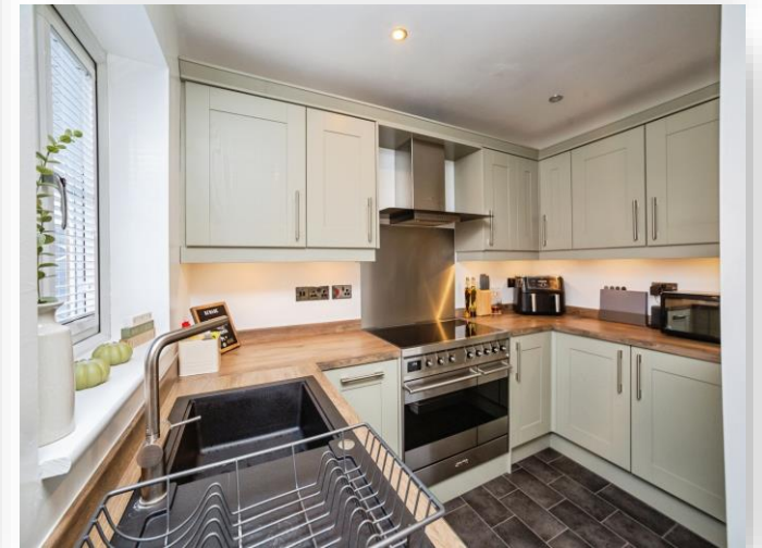
Canalside View, Kilnhurst Mexborough S64 5SD