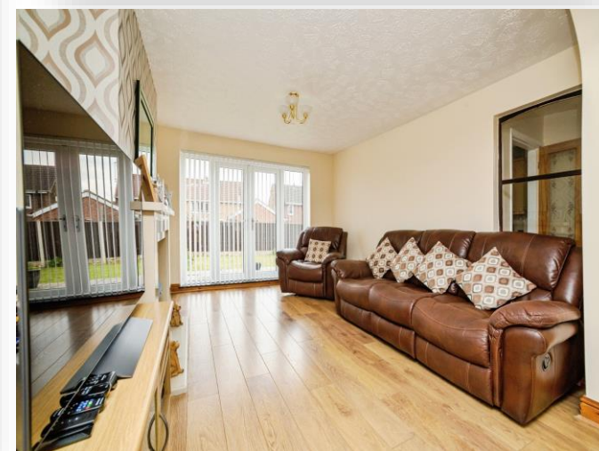
Cedar Grove, Conisbrough Doncaster DN12 2LA