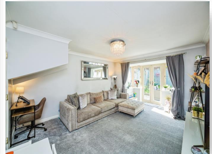
Goldfinch Court, Wath-Upon-Deerne Rotherham S63 6FJ