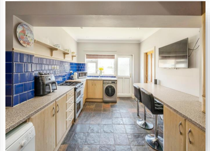
Highfield Road, Conisbrough Doncaster DN12 2DE