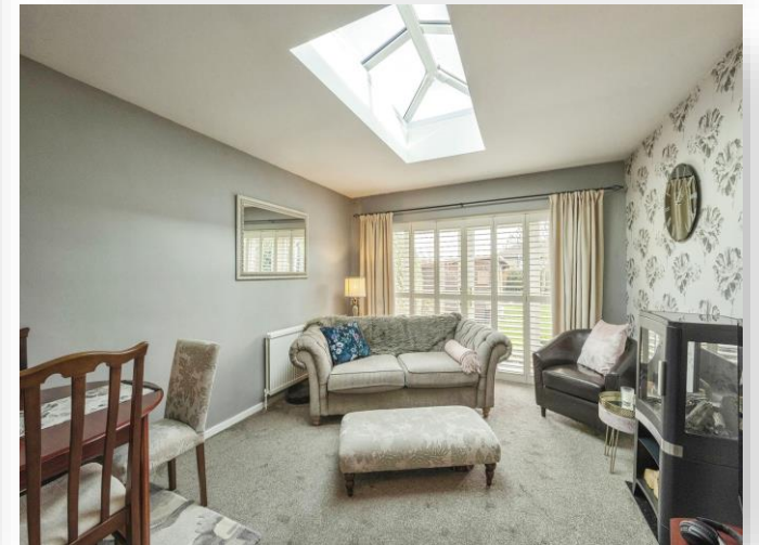
Chapel Street, Wath-Upon-Dearne Rotherham S63 7RL