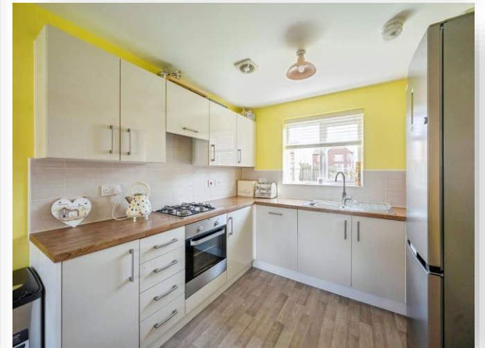
West Moor Croft, Goldthorpe Rotherham S63 9FJ