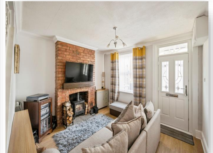
Ivanhoe Road, Conisbrough Doncaster DN12 3JT