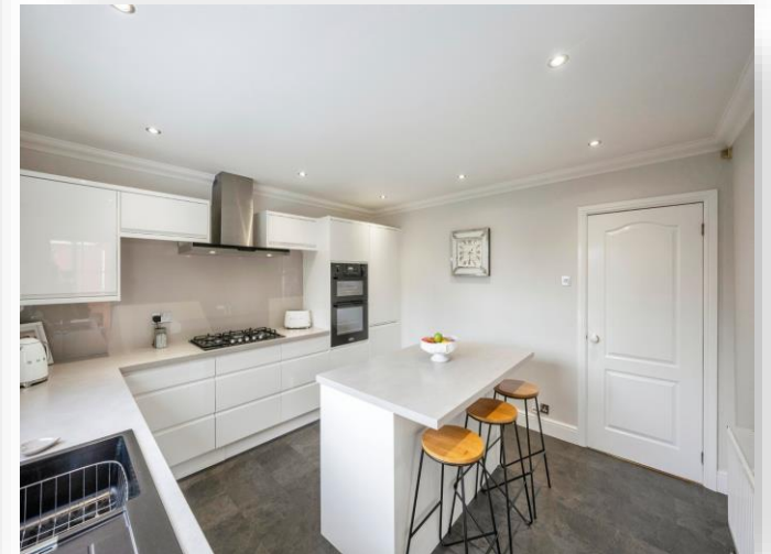
Riverdale Church Street, Mexborough S64 0HH