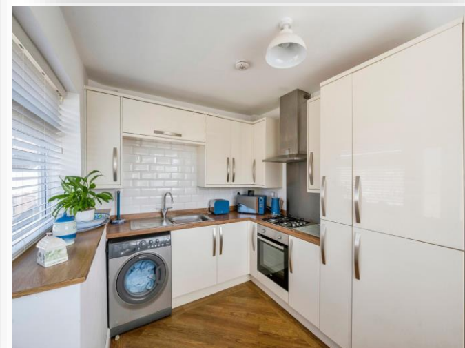
West View Crescent, Goldthorpe Rotherham S63 9BB