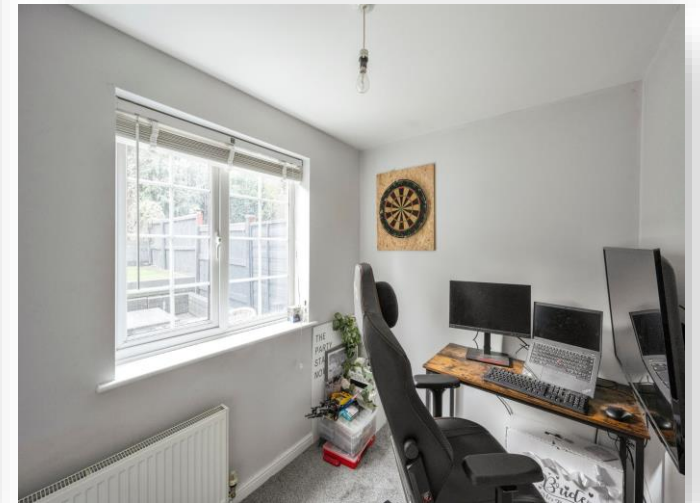
Riverside Close, Conisbrough Doncaster DN12 3GA