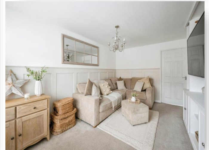
Pickhills Grove, Goldthorpe Rotherham S63 9FP