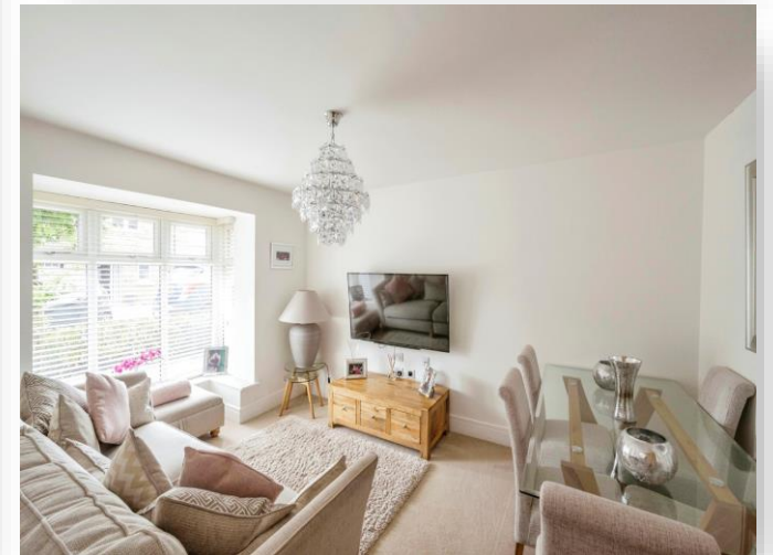
Avocet Close, Mexborough S64 0FJ