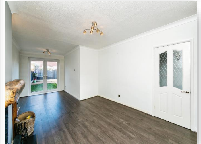
Dove Close, Bolton-Upon-Dearne Rotherham S63 8JL