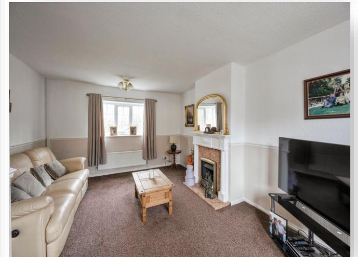
Burnside, Thurnscoe Rotherham S63 0PW