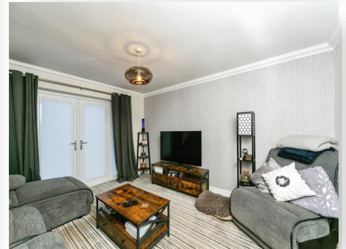
St. Peters Drive, Conisbrough Doncaster DN12 2ER