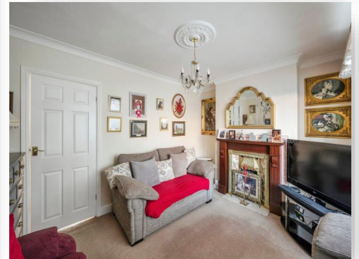
Park Road, Conisbrough Doncaster DN12 2ES