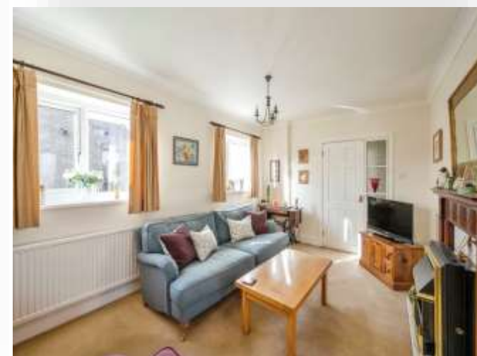
Tithe Barn Court Crow Tree Lane,Adwick-Upon-Dearne Mexborough S64 0NT